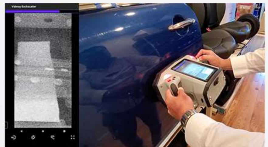
LEAD FALSE TRAP DETECTION

529 Main St, Suite 100, Charlestown, MA 02129